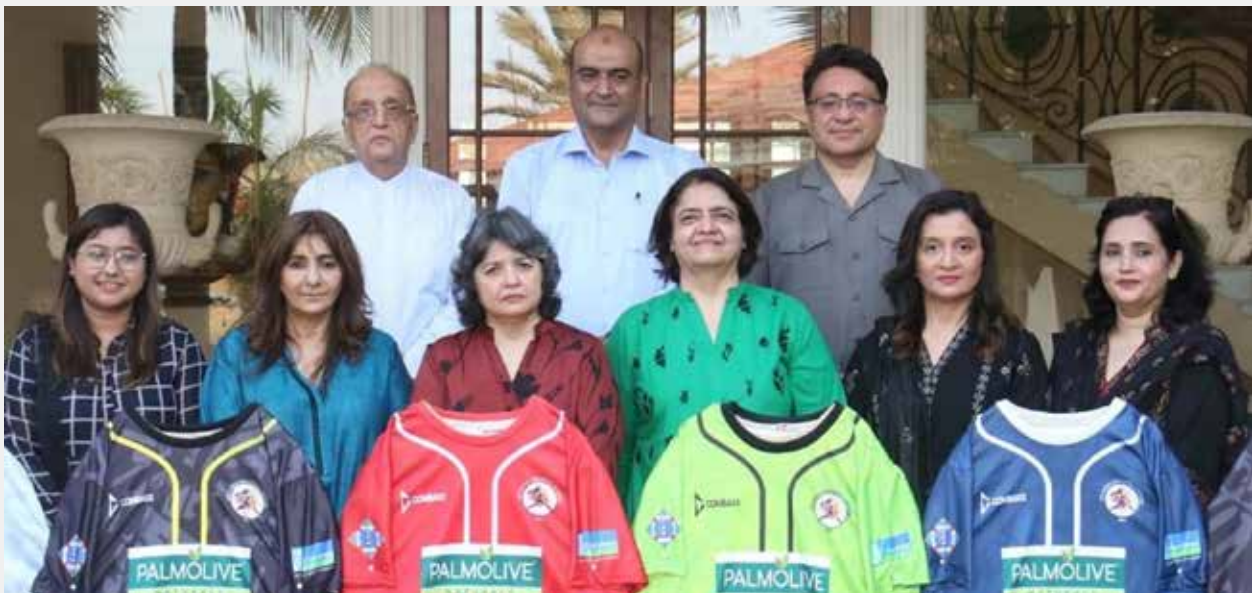
The kits unveiling ceremony organized at Governor's House Karachi.